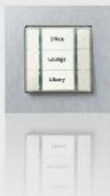
GAMMA instabus pushbutton nature* / titanium white