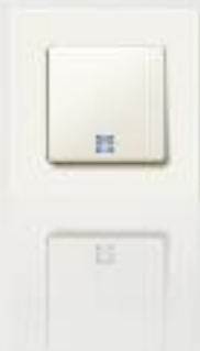
LED light inserts