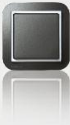
carbon metallic / chrome / carbon metallic