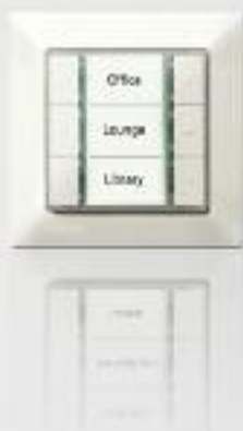
GAMMA instabus pushbutton titanium white