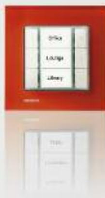
GAMMA instabus pushbutton orient* / titanium white