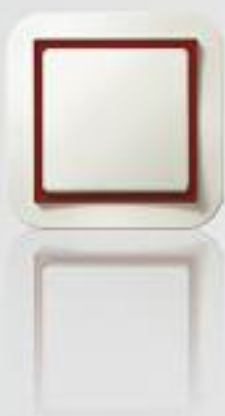
titanium white / red / titanium white