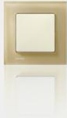
arena* / electrical white