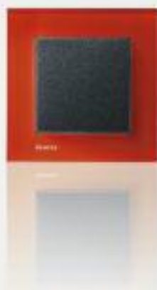
orient* / carbon metallic