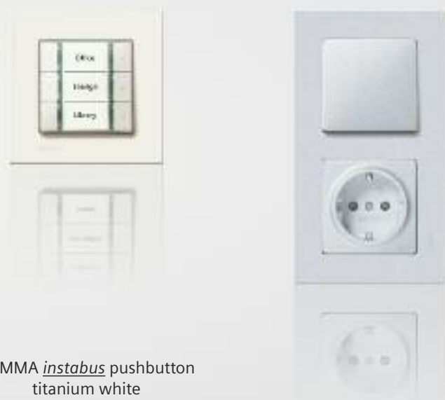
GAMMA instabus pushbutton titanium white

Attractive design, attractive price – no longer a contradiction with DELTA miro color. If you are keen to furnish your entire house with a single switch line, a solution based on DELTA miro color represents an exciting alternative. Alone or in combination with DELTA miro glass, wood or aluminum.