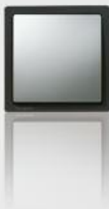
basalt black / platinum metallic*