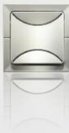
arctic white / arctic white