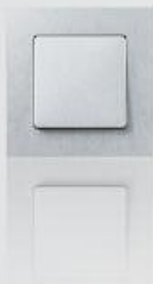
nature* / aluminum metallic