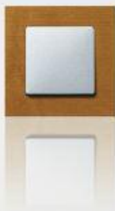
cherry* / aluminum metallic