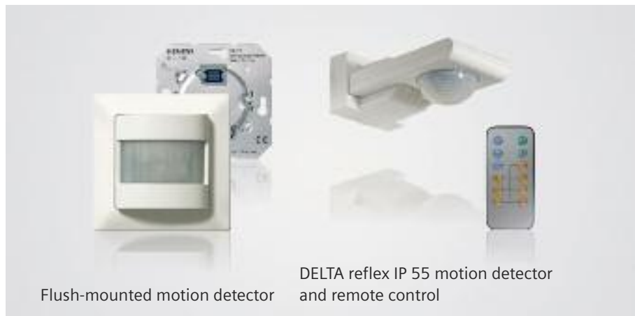
Flush-mounted motion detector