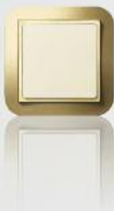
gold / gold / electrical white