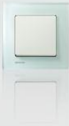
crystal green / aluminum metallic