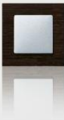
wenge / aluminum metallic