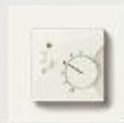
Room temperature control