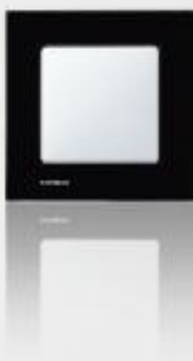
black* / aluminum metallic