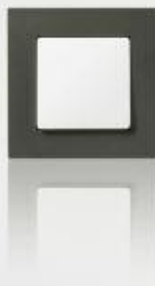
graphite* / titanium white