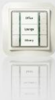
GAMMA instabus pushbutton titanium white / titanium white / titanium white