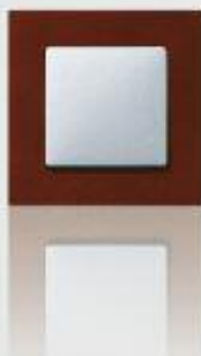
red maple / aluminum metallic