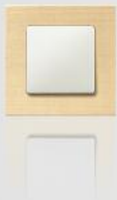
maple / titanium white