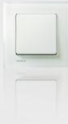
white* / titanium white