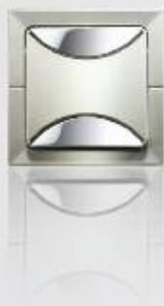
arctic white / steel