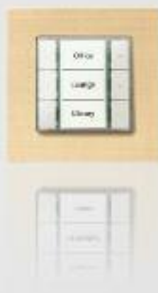
GAMMA instabus pushbutton maple / titanium white