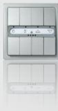
GAMMA instabus pushbutton platinum metallic*