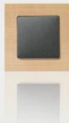
beech* / carbon metallic