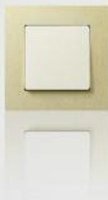
oxide yellow* / electrical white