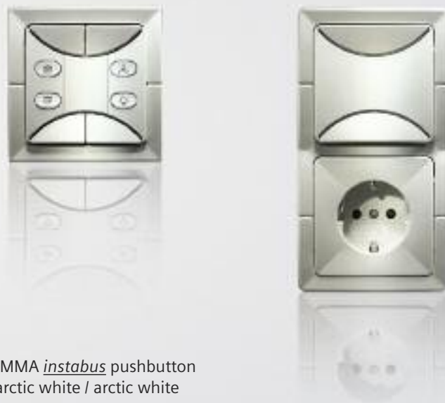
GAMMA instabus pushbutton arctic white / arctic white

Unusual rooms need unusual operator interfaces – that little bit more than a standard range can offer. This is the philosophy on which DELTA ambiente is based. The outcome: a switch range that is exceptional in every respect. Exclusive colors and design. The surfaces of the rocker buttons are offset with the illuminated elements that give DELTA ambiente its unique charm, bringing an inimitable style to your home.