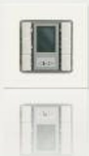
GAMMA switches and displays