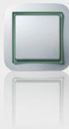
aluminum metallic / green / aluminum metallic