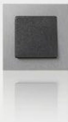
titanium* / carbon metallic