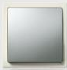
titanium white / platinum metallic*